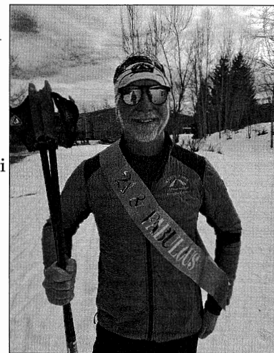
21 years of TUNA