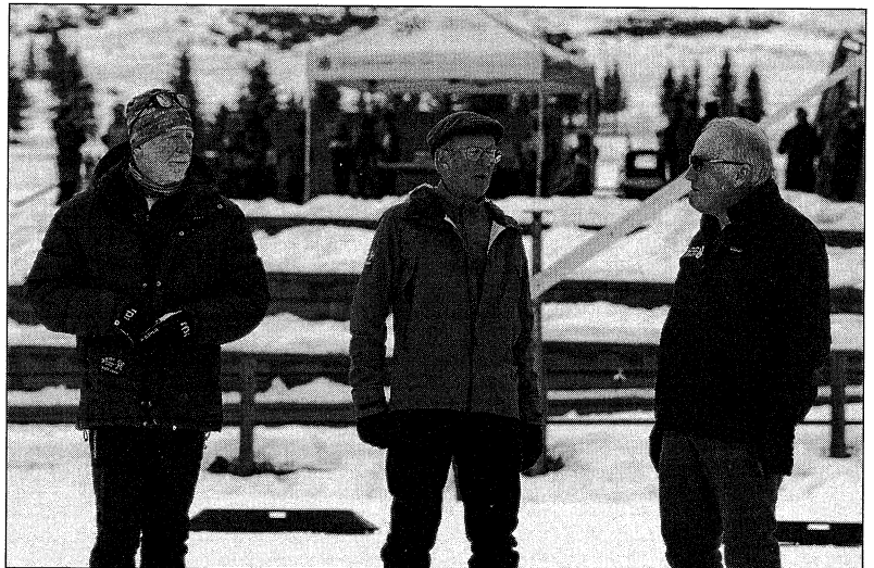
Three wise men at the WCS